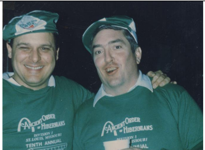
Flash Back !